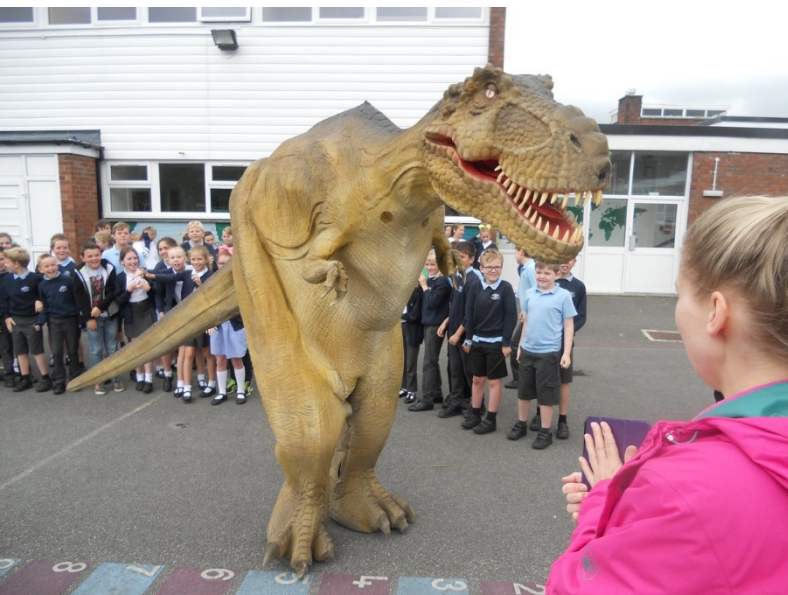
£700 Dinosaur end of year treat for whole school