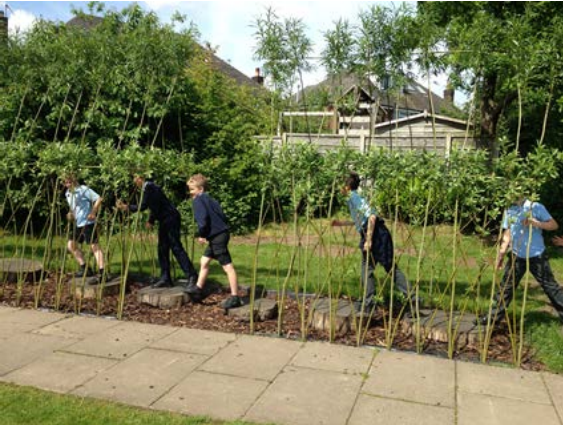
£308 on the willow Tunnel